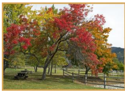
Autumn Glory by Rita Westfield