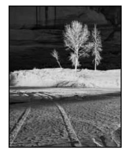
(Tips adapted from "Kodak Pocket Guide to Great Picture Taking," Simon and Schuster, 1984)